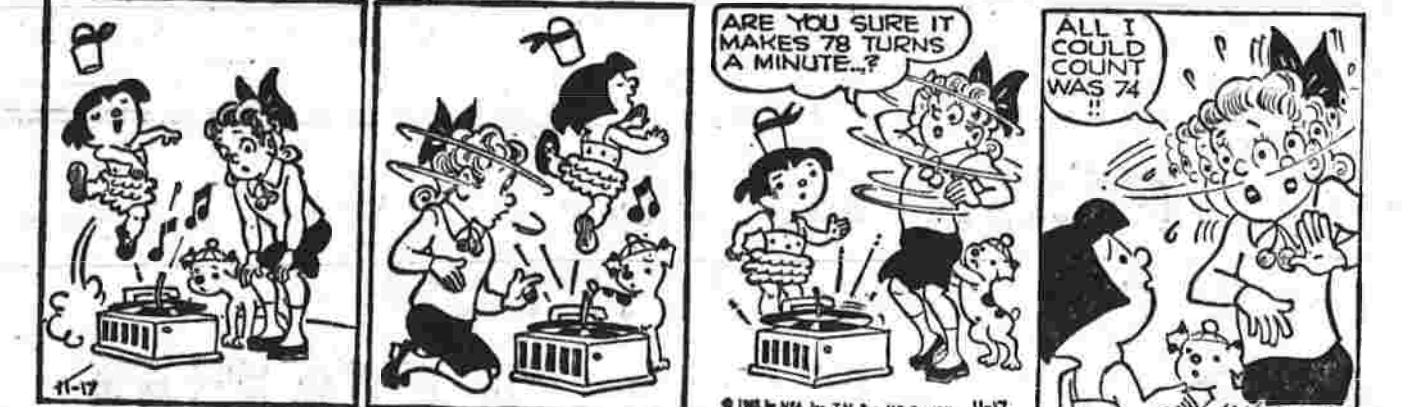
PRISCILLA'S POP BY AL VERMEER