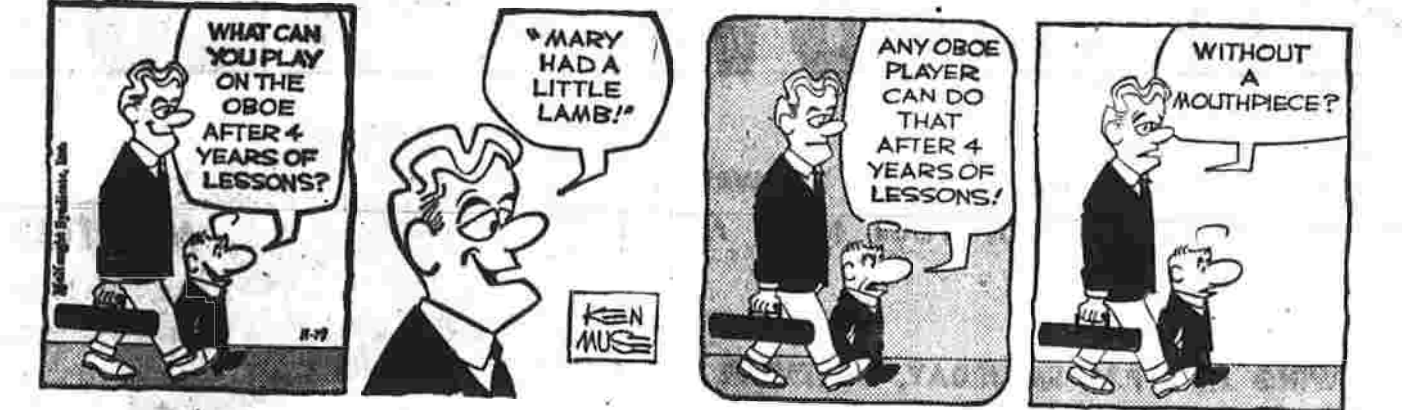
WAYOUT BY KEN MUSE