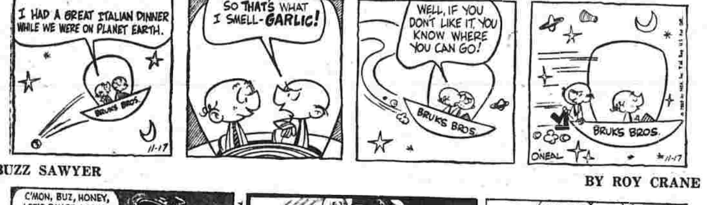
SHORT RIBS BY FRANK O'NEAL