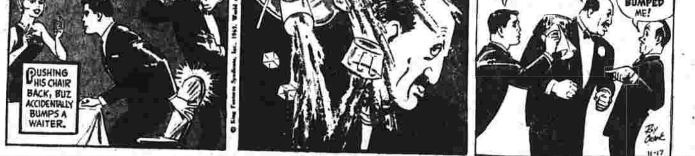
BUZZ SAWYER BY ROY CRANE